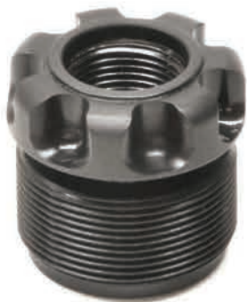
3 LUG MOUNTS